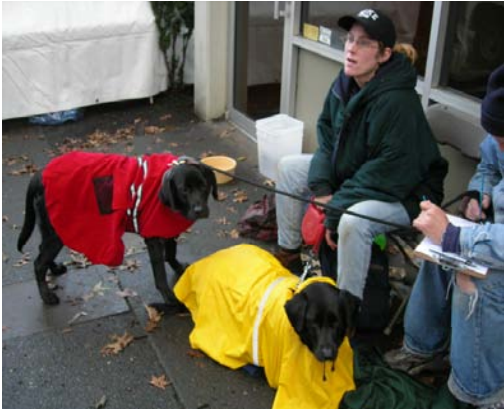
Protection from winter cold: PAW Team clients show off their new winter coats donated by PAW Team supporters and distributed at a winter clinic

Clinic volunteers also help with nail trims and basic grooming. Pet guardians receive educational information on animal care, training and disease, as well as coupons for low-cost spay/neuter. With more donations, PAW Team hopes to one day fund a free spay/neuter program.